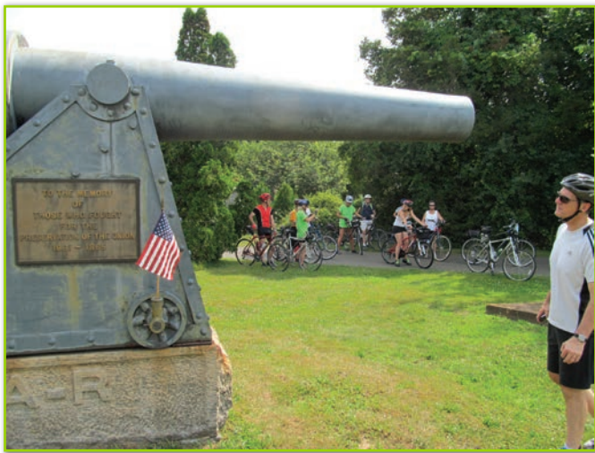
Guilford's 'First Saturday' bike ride last summer along historic Boston Street included a visit to Civil War cannon in Alderbrook Cemetery.