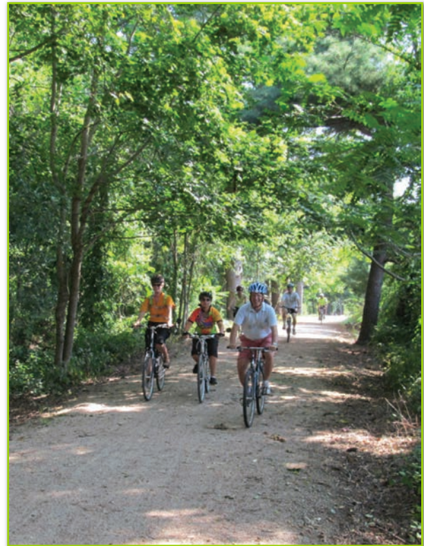
Friends enjoyed a 'First Saturday' Bike Ride along newly finished SGT Trail at Hammonasset

Shoreline Greenway Trail's 'First Saturday Walks' - and a Bike Ride - drew hundreds of participants throughout the year, including at our first annual Holiday Walk on December 26. This popular monthly event is a great way to enjoy the Trail, learn about new happenings in the Trail's development, explore other trails, sometimes by bike, and meet new friends.