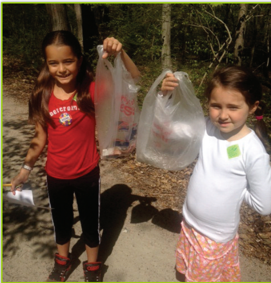
Branford third graders from Mary T. Murphy Elementary School enjoy picking up litter near Chet's Pond on a walk with Shoreline Greenway Trail.

In the coming year, the Branford team will focus on making progress on all Trail sections as well as establishing a Trail steward system, strengthening coordination with town officials, and expanding outreach to local organizations and schools.