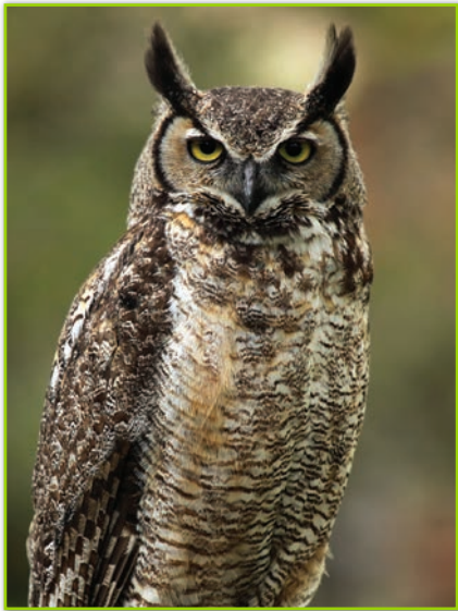
The Great Horned Owls are once again nesting at Hammonasset, thanks to the efforts of A Place Called Hope. The nest sits in a platform 75 feet up in one of the pines just off the off the Trail in the campground area.

Just 3 blocks from the Trolley Museum, at the Meeting Hall of the East Haven Christ & Epiphany Episcopal Church, located at 39 Park Place. Light snacks will be served.