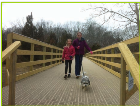
Enjoying the new boardwalk at Hammonasset Beach State Park