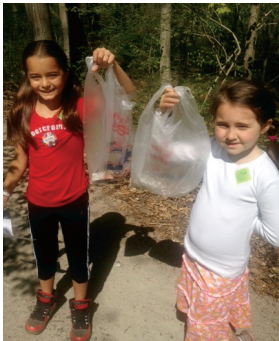
3rd graders cleaning the trail.