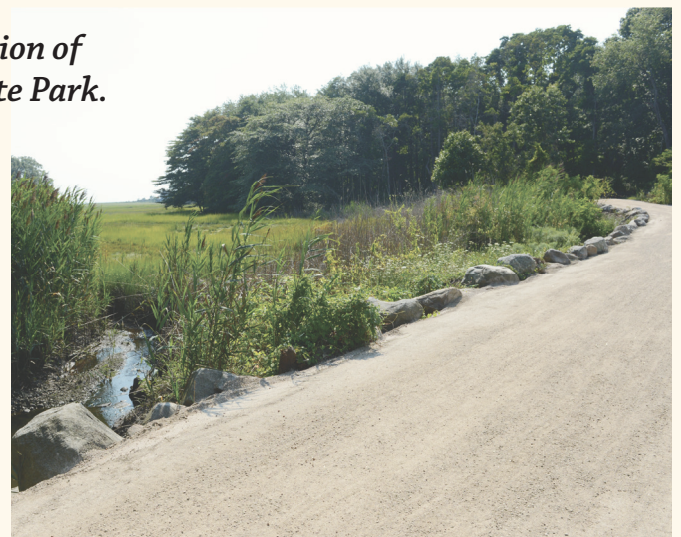
New peninsula section of our Trail at Hammonasset Beach State Park.