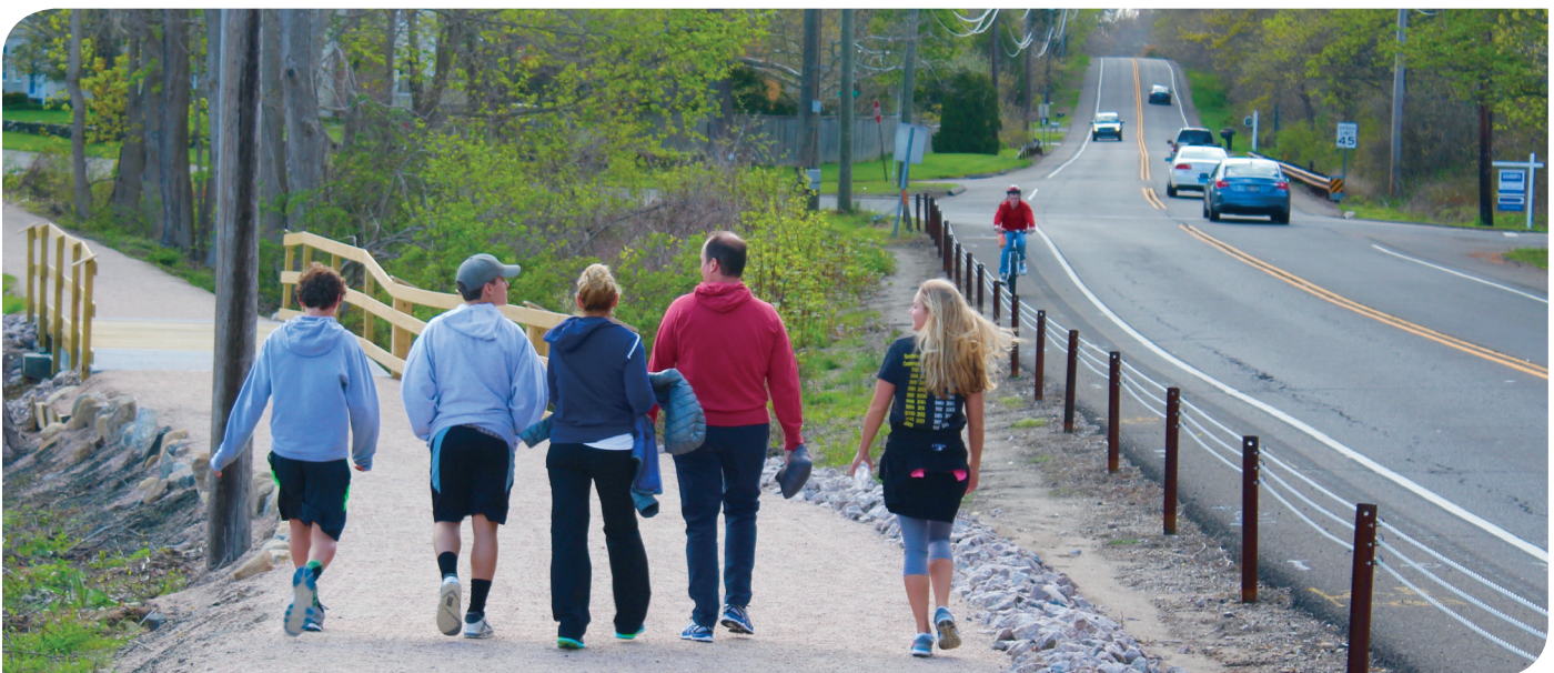
The newest Madison section of trail runs off-road parallel to Route 1 near Hammonasset Beach State Park.

With the Hammonasset section complete, we are turning our attention to other parts of town. The Board of Selectmen recently voted to use a federal grant coming through the Connecticut Department of Transportation to build a section starting at the East River bridge and heading approximately 4,000 feet eastward. Funding will be augmented by a bond through the state Department of Energy and Environmental Protection. The Madison Engineering Department will oversee the design. This new section will connect with a soon-to-be-built Guilford section, linking the two towns and creating a pathway nearly two miles long.