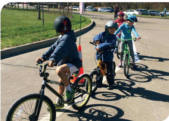
Young riders learn safe-biking skills at a Bike Safety Rodeo sponsored by SGT in Guilford in 2015.