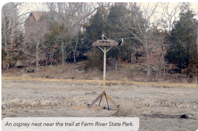
An osprey nest near the trail at Farm River State Park.

Saturday, August 6 - FIRST SATURDAY WALK in East Haven, beginning at the D.C. Moore School's Elliot Street parking lot, 10 a.m. Take a picturesque walk on the Greenway Trail to a panoramic overlook onto the Bradford Preserve and into Farm River State Park. See butterflies and several species of birds, glacial outcroppings, mountain laurel, hickory and tulip trees, osprey nests, caves and spectacular views of the Farm River. The 1.5-mile route features two steep areas and should take about 90 minutes.