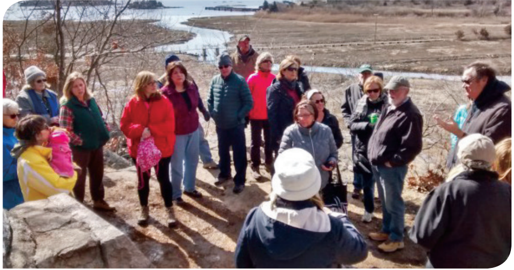
Hikers on an SGT First Saturday Walk in Branford pause by the marsh at the Stony Creek Trolley Trail bridge.