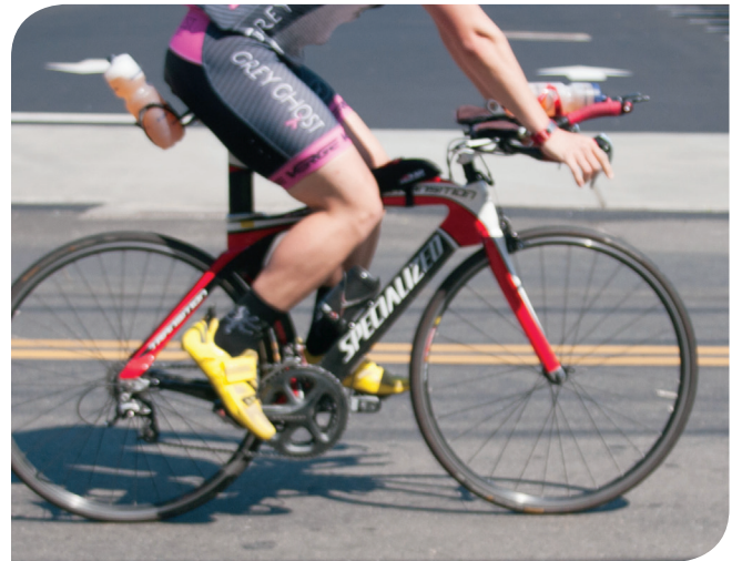
Shoreline Greenway Trail is working to improve mobility, safety and infrastructure for non-motorized transportation throughout our five-town region.

Driving all that, inspired by what many of our trail-building compatriots have achieved in other cities and towns across America, is a revitalization of a core aspect of our original vision: to work as a unified organization to have meaningful, positive impact on important regional issues. We're approaching what we do and prioritizing our many projects around efforts to increase the active-mode share of regional transportation, to reduce dependence on private automobiles, to improve community health and public safety, to reduce air pollution and do our part to counter global warming, and to bolster the economic vitality of our communities and make them more appealing places to live and work, especially for future generations. We think of what we're doing as building