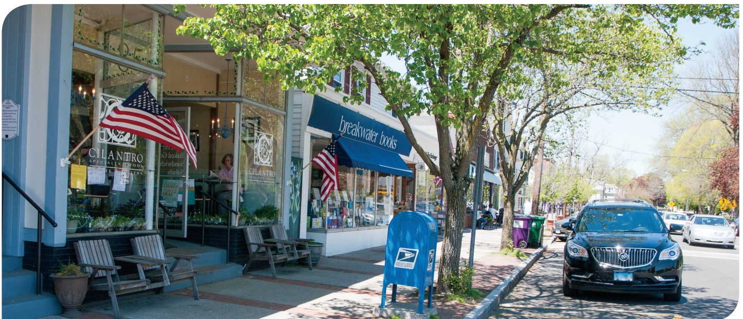
SGT is working with officials to improve bicyclist and pedestrian accessibility in downtown Guilford.