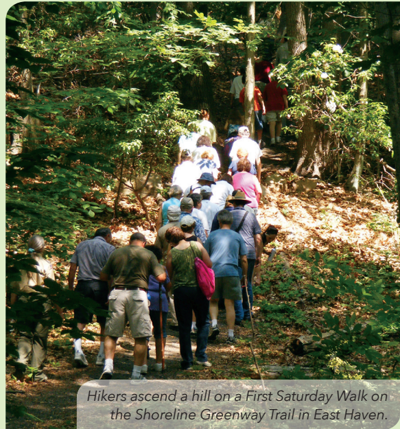
Hikers ascend a hill on a First Saturday Walk on the Shoreline Greenway Trail in East Haven.