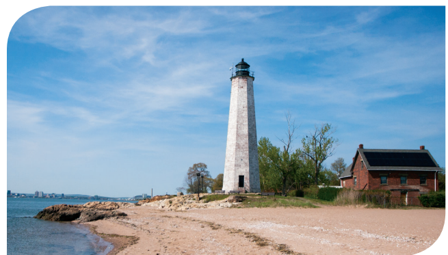
Lighthouse Point Park, the western terminus of the Shoreline Greenway Trail.

That said, the New Haven section of trail—only about a half-mile long—presents serious challenges. It's a tough economic climate in which to raise funds, especially in a city with many competing needs. We are focusing on strengthening our New Haven organization, along with building political and business support, while plotting a satisfactory and environmentally sensitive route between Lighthouse Point and the East Haven border. We'd welcome your ideas and involvement!