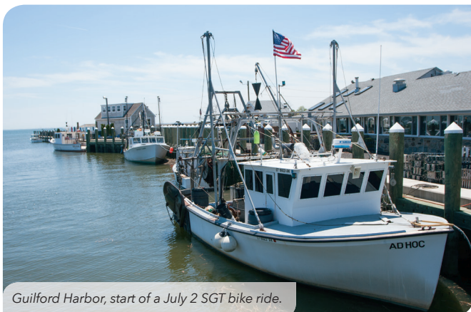
Guilford Harbor, start of a July 2 SGT bike ride.

Saturday, July 2 - FIRST SATURDAY BIKE RIDE from Guilford to Madison, 8:30 a.m. Start your holiday early with a flat, 15-mile, round-trip bike ride on-road from Guilford Harbor to the boat launch at Circle Beach in Madison, passing Guilford's soon-to-be-built first section of Greenway Trail beside Route 1. Experienced riders over age 14 only. Helmets and signed waivers required.