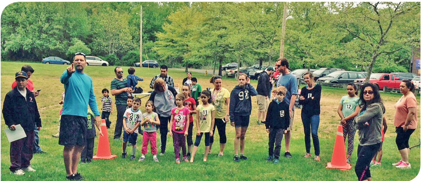
SGT volunteers helped organize Kids Challenge 2016 to promote health and wellness in the East Haven community.

As usual, all of the progress we've made is the result of the tireless work of our volunteers, the encouragement and support of our town and state-government partners, and the generosity of our donors. We can't thank them enough.