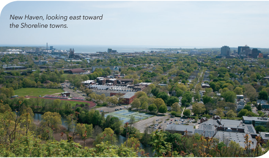
New Haven, looking east toward the Shoreline towns.