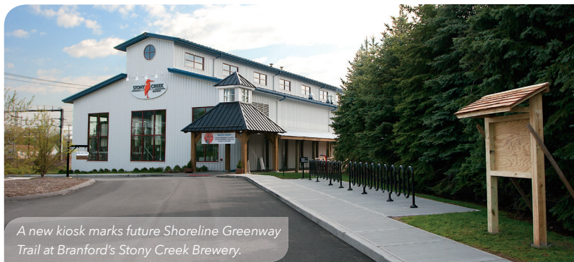
A new kiosk marks future Shoreline Greenway Trail at Branford's Stony Creek Brewery.