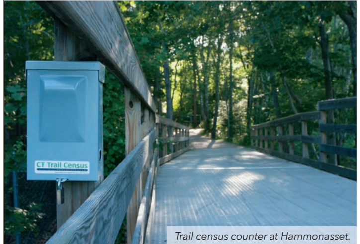
Trail census counter at Hammonasset.

plan for Madison and advise selectmen on funding, projects and policies to make walking and cycling safer and to promote these active modes of travel for transportation, recreation and fitness. Nine Madison