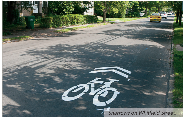
Sharrows on Whitfield Street.

Meanwhile, SGT will keep advocating for safer and better facilities for bicyclists, pedestrians and others who use non-motorized transportation in Guilford—including off-road trail, bike lanes coupled with sidewalks, marked shared lanes and traffic calming as appropriate. One example of such an effort was the installation in July of shared-lane markings, or "sharrows," on Whitfield Street. This was possible thanks to a generous grant to the town from the Guilford Foundation, which we facilitated.