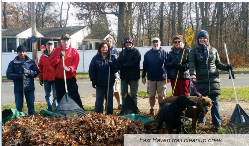
East Haven trail cleanup crew.

Your financial support is essential to Shoreline Greenway Trail, but volunteers are our lifeblood. As an all-volunteer organization, we rely on dedicated people working behind the scenes and in the field to keep SGT functioning; to design, build and maintain trail; to organize walks, bike rides and other events; raise money; and keep our technology humming and people like you informed.