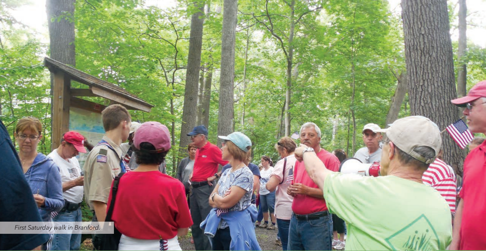
First Saturday walk in Branford.