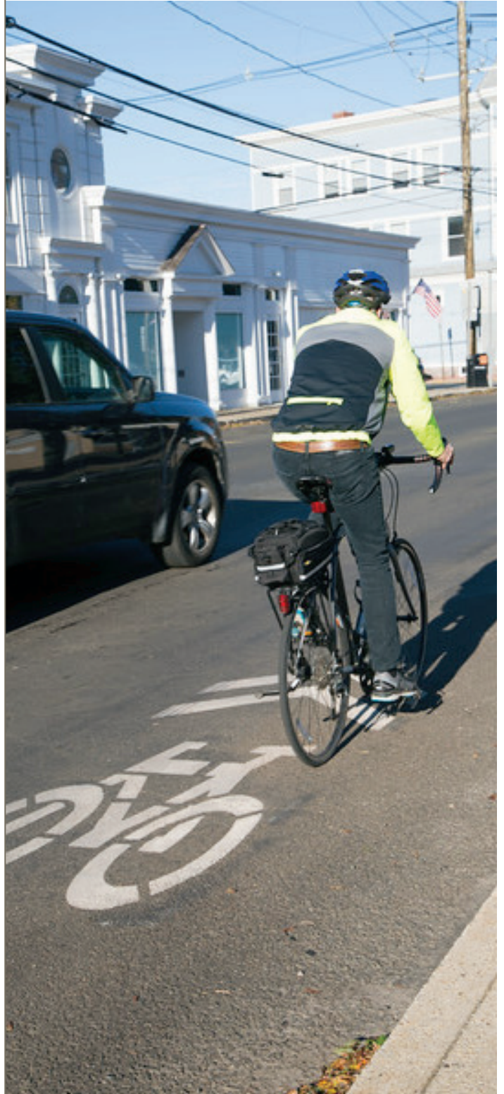
COVER PHOTO Local teenagers walk safely off-road on the Hammonasset section of the Shoreline Greenway Trail next to Route 1 in Madison. Right, sharrows painted on Whitfield Street call attention to the need to share the lane in Guilford.