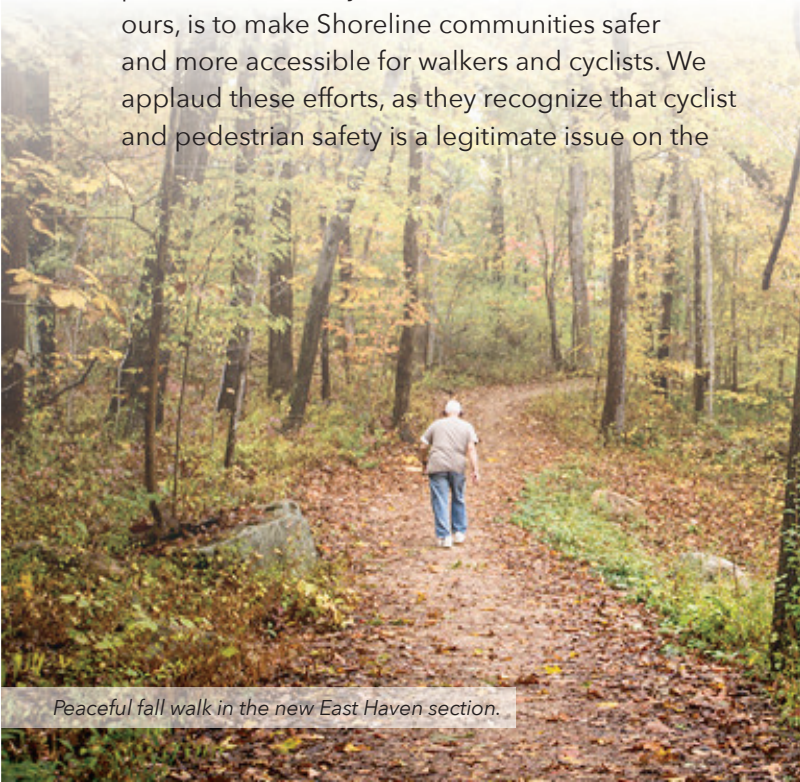
Peaceful fall walk in the new East Haven section.