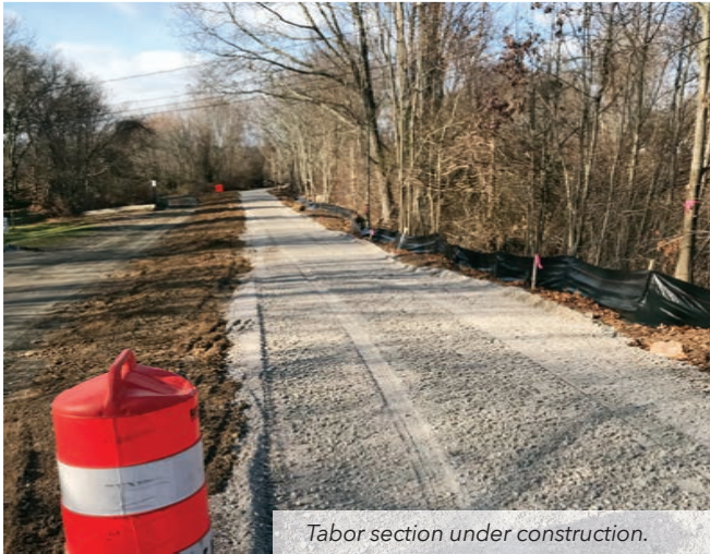
Tabor section under construction.

This past year has been a great one for the Shoreline Greenway Trail in Branford. The most exciting news is that the Tabor section, 7/10 mile long, has been completed. The final chip-seal surface was scheduled to be applied and the Pine Orchard Road crossing