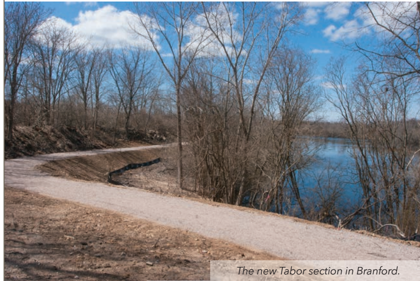
The new Tabor section in Branford.

As we evolve into a more visible role as a bike/pedestrian advocate, the towns of Branford, Guilford and Madison—with our strong encouragement—have taken steps to create bike/pedestrian advisory committees. Their aim, like ours, is to make Shoreline communities safer and more accessible for walkers and cyclists. We applaud these efforts, as they recognize that cyclist and pedestrian safety is a legitimate issue on the