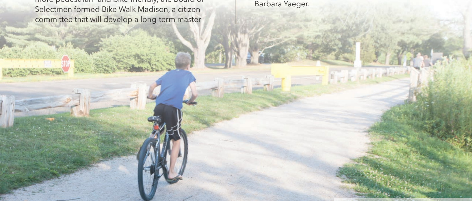
Enjoying the Hammonasset trail.