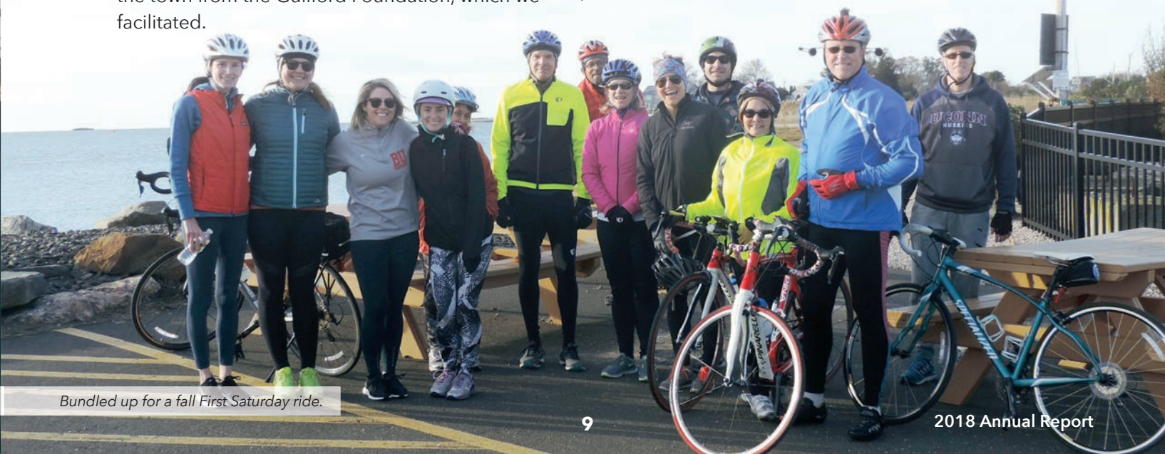
Bundled up for a fall First Saturday ride.