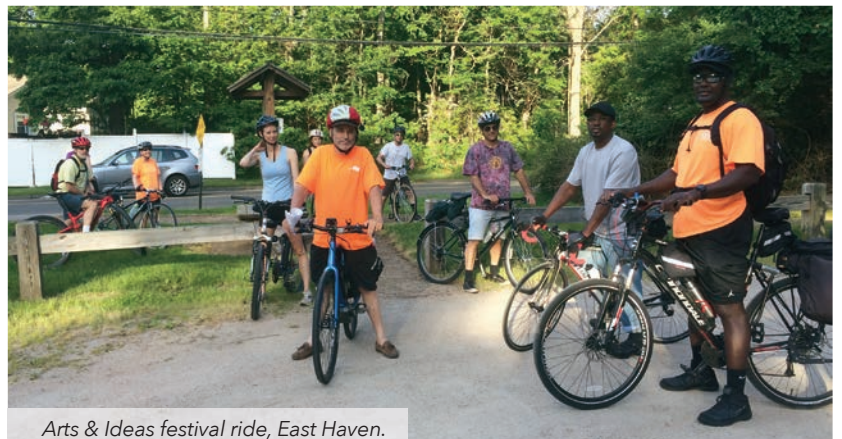
Arts & Ideas festival ride, East Haven.