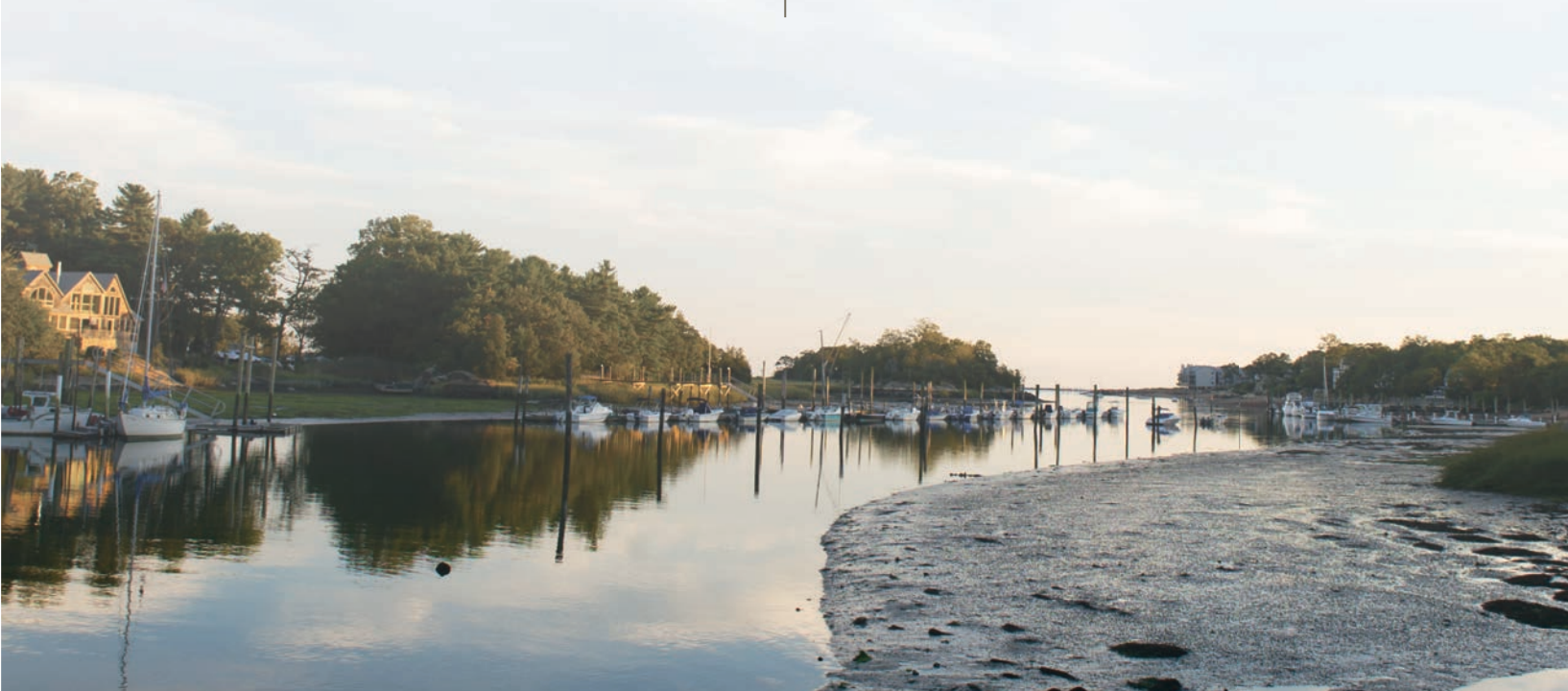
View of the Farm River from East Haven trail.