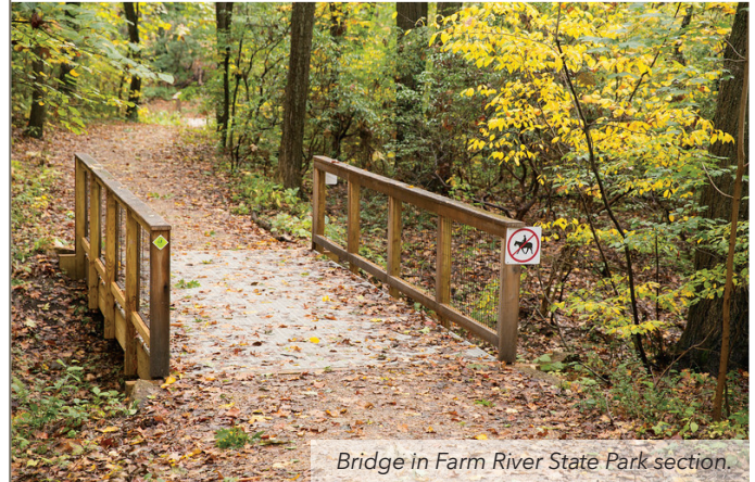
Bridge in Farm River State Park section.